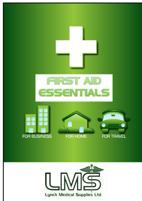
LMS FIRST AID ESSENTIALS Catalogue 2011