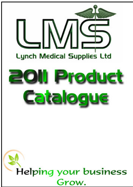
LMS OTC Catalogue 2011